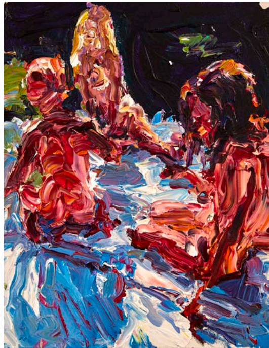
Sun Witches, 35x45cm, Acrylic on Canvas, 2018