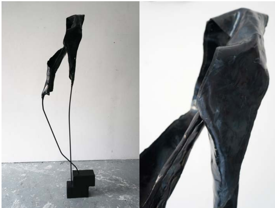
Untitled (Nr.13), 203x60x25cm, rubber, iron, aluminium, cement, 2018