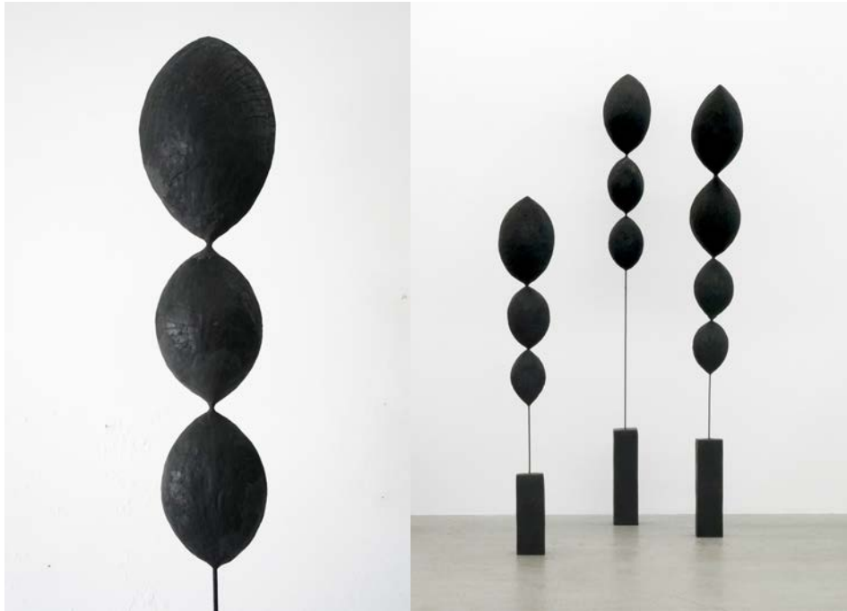
Untitled, small 220x18x28cm, tall 248x18x28cm, epoxite, concrete, iron, styrofoam, 2016