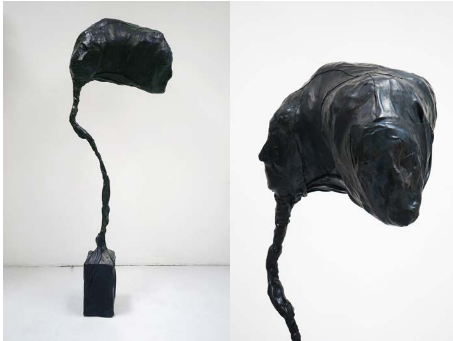
Untitled (Nr.8), 135x48x27cm, rubber, iron, aluminium, cement, 2018