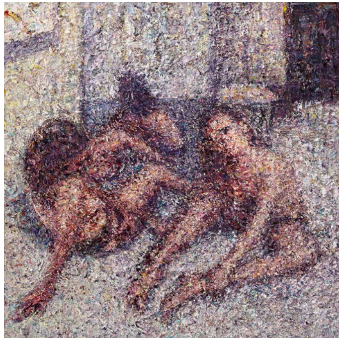
SisterSisterSister, 122x122cm, Acrylic on Canvas "Slow Painting", 2018