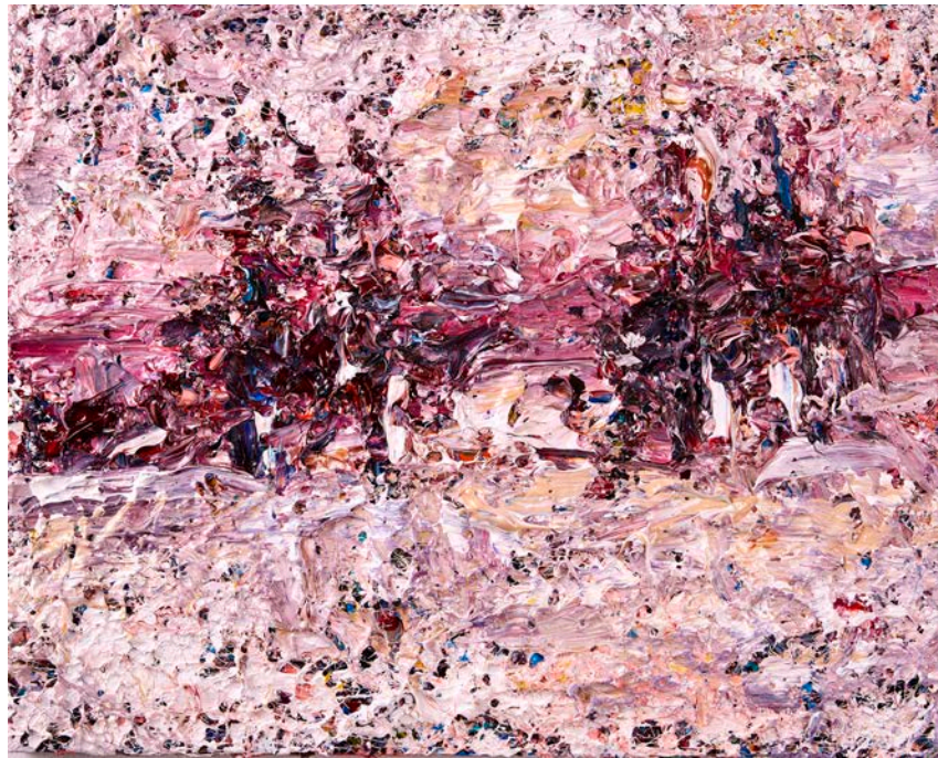
Winter Trees, 40x50cm, Acrylic on Canvas "Slow Painting", 2018