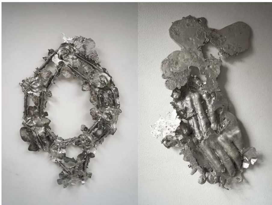
Untitled (Relief Nr.8), 64x43x5cm, Untitled (Relief Nr.9), 43x27x6cm rubber, iron, aluminium, cement, 2018