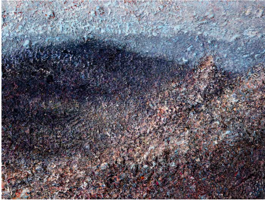
Leather Faced Mountains, 92x122cm, Acrylic on Canvas "Slow Painting", 2018