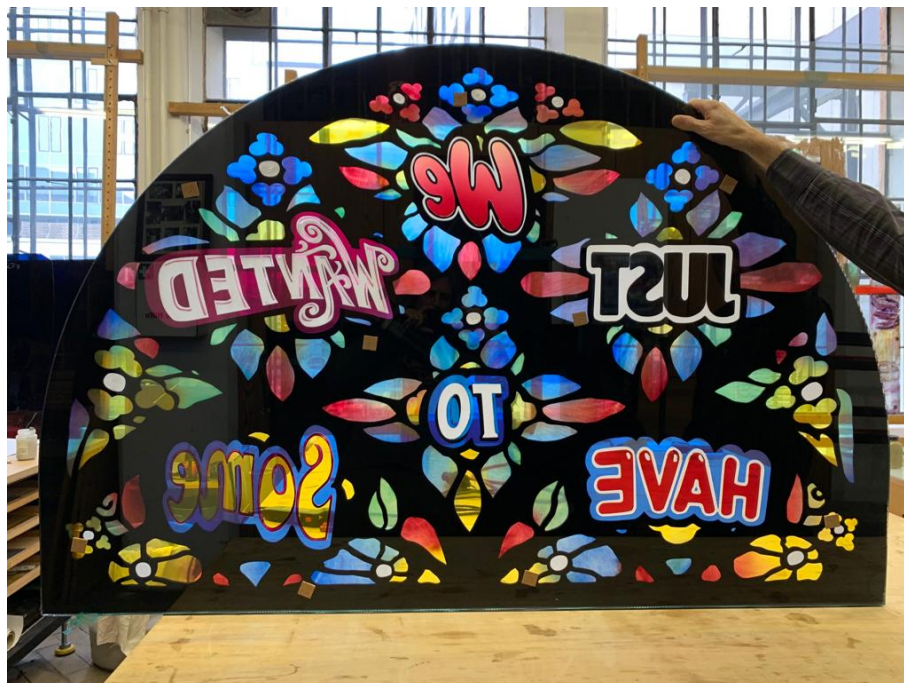
Work in progress at Mayer of Munich, 2019