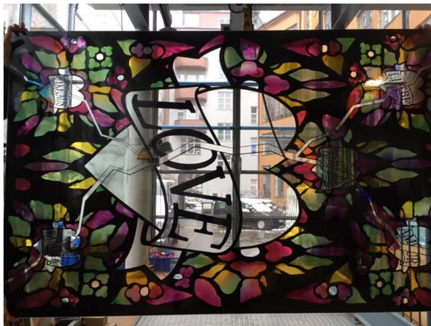
Work in progress at Mayer of Munich, 2019