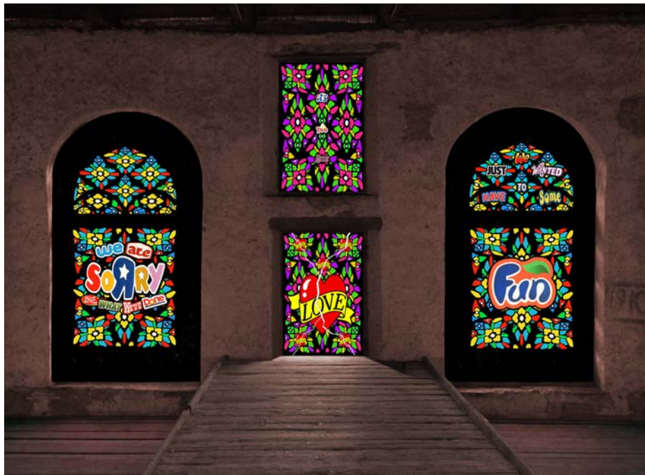
Sketch of „Chapel of Remorse“, Stalla Madulain, 2019