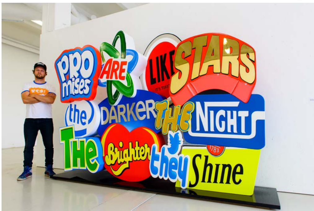
Jani Leinonen and Promises Are Like Stars, metal, fiberglass, alkyd, 290,5x201x30cm, 2013