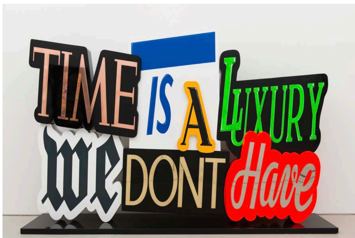
Time, glass, fiber, alkyd, 300x200x31 cm, 2013