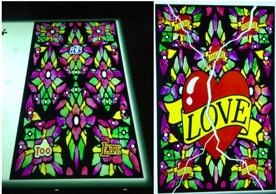
Work in progress at Mayer of Munich, 2019